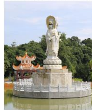
Guanyin of the Southern-sea