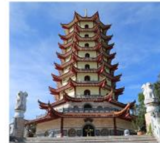
9-layers Pagoda (Fa-hua-ta)

The KBS Buddhist Village is an initiative by the Kuching Buddhist Society based on the vision of creating a Pure Land on Earth. At the centre of the Buddhist Village is Mi-tuo-yen (Amitabha Courtyard) where there is a Triple Gem Hall, Tee-chan Relics Hall, a vegetarian restaurant, and a bereavement and funeral service hall with crematorium and columbarium facilities.